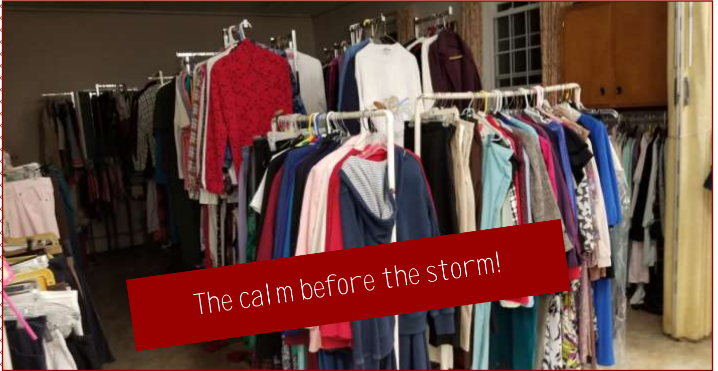
The calm before the storm!